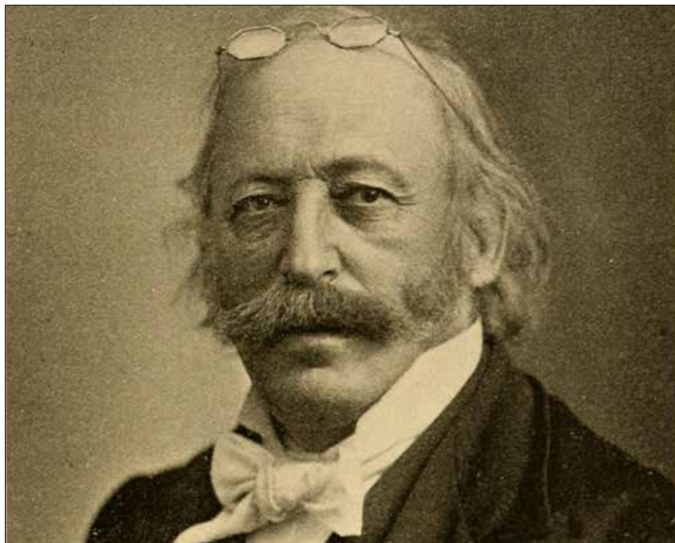
Isaac Mayer Wise, the architect of Reform Judaism in America, founded the Hebrew Union College in Cincinnati.

"We are making this hard call now, rather than waiting until we are forced