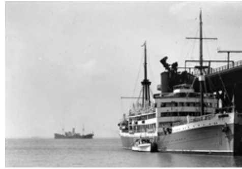
The steamship Quanza in the port of Hampton Roads, Virginia.

who got involved "heroes who chose to stand up and not be bystanders, who got out of their comfort zones and made a difference."