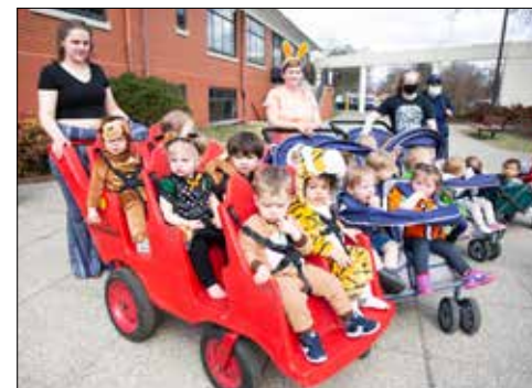
The Pomegranates class of the JCC's Early Learning Center didn't miss the chance to dress for Purim and to display artwork made specifically for the festival.