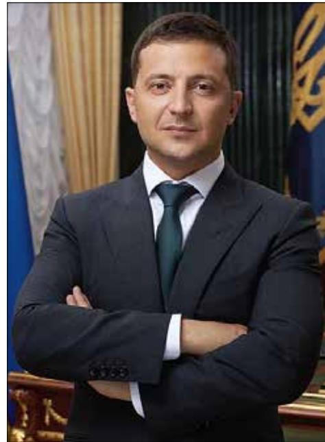
Ukrainian President Volodymyr Zelensky: "... they don't want to leave any remnant of us."

But as he drew to a close, he excoriated Israel's government for not making hard choices and called on it to