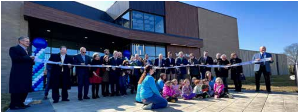
Jewish leaders and Gov. Andy Beshear cut the ribbon on the new Trager Family Jewish Community Center during a March 10 dedication ceremony as Early Learning Center children sat in front.

"We deserve good news," the governor said to waves of applause, "and this ribbon cutting is terrific news