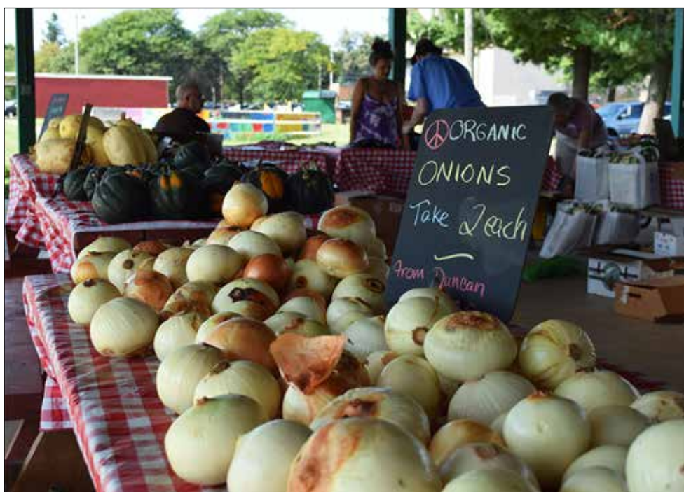
Area chefs will demonstrate how they cook with farm-fresh ingredients during the Farm-to-Table program at The J.

JOFEE also supports the Gendler Grapevine Fresh Stop Market, a sliding-scale local produce market that makes