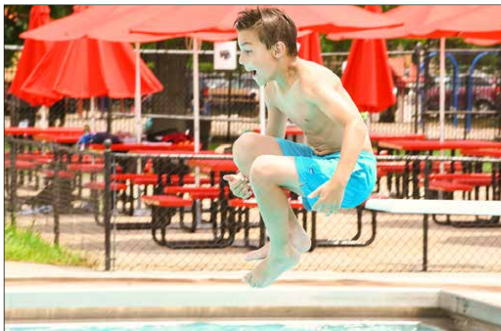
The J pools opened to the community on Memorial Day weekend, offering wet, wild fun to parents and children alike. Summer memberships are available