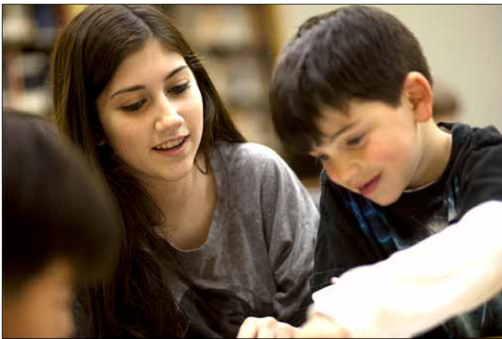
To expose their children to the wealth of Jewish culture, three separate day school tracks now exist in Jewish Louisville. But some wonder if the community can support all of them.