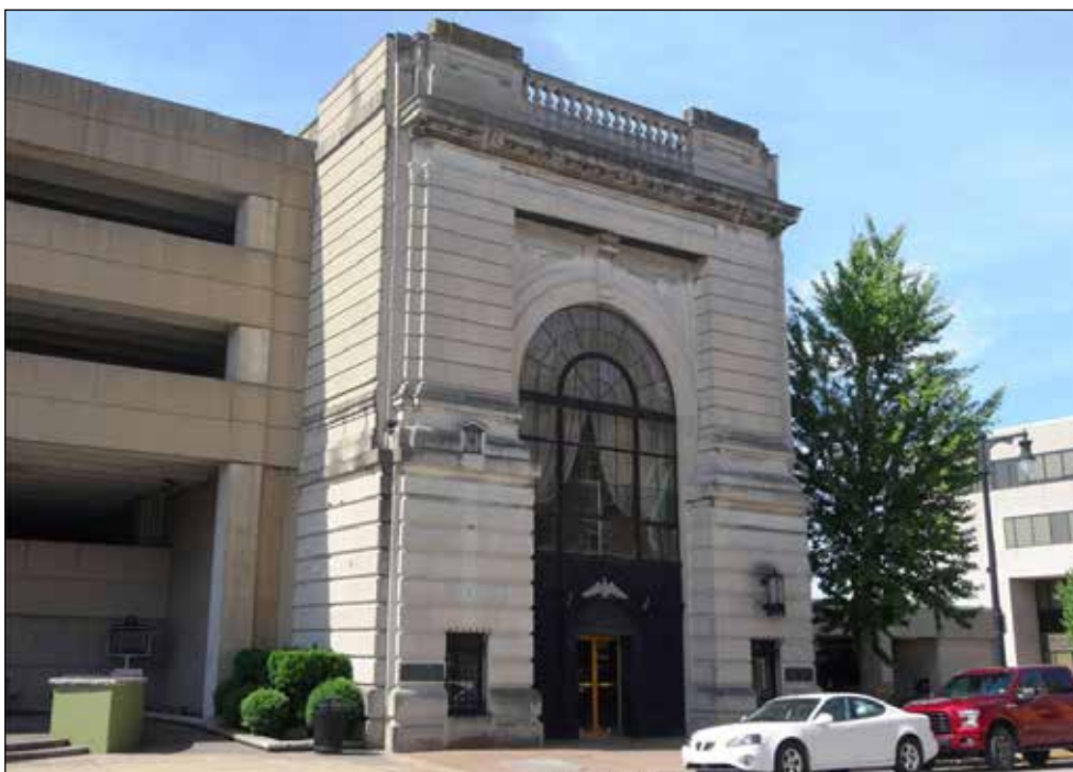
The historic First Financial Bank in Terre Haute will be the future home of the CANDLES Holocaust Museum, the only such institution dedicated to the twin victims of Dr. Josef Mengele's experiments at Auschwitz.

"First Financial is pleased to help preserve a building known to generations of people in this area," CEO and President