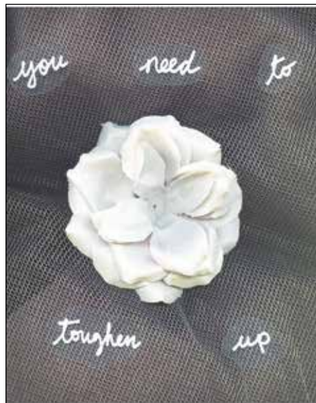
You need to toughen up-Annika Klein

The 2017 Louisville Photo Biennial will be held from September 22 to November 11. Started in 1999 by four East Market Street galleries, the Louisville Photo Biennial has grown to encompass sixty photographic exhibits at fifty-three venues throughout Metro Louisville, southern Indiana and central Kentucky. The 50+ photography exhibitions – spanning traditional to contemporary, local to global work – are mounted at museums, galleries, universities and