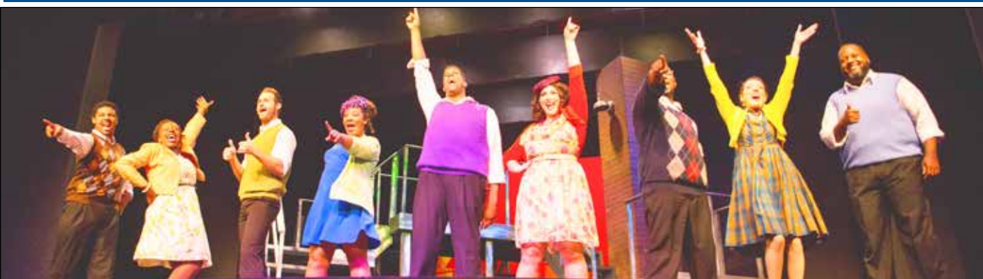
CenterStage presented Smokey Joe's Cafe September 7-17. The soundtrack of the 50's featured songs like "Hound Dog," "Jailhouse Rock" and Stand by Me."