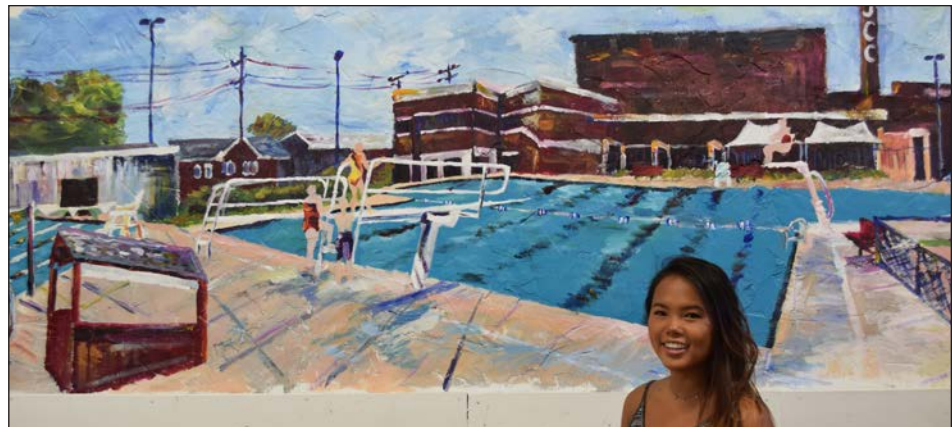
The completed mural in the indoor pool.

members!" Kimberlin said. "The mural will remind them of our great outdoor pool during the cold days of winter."