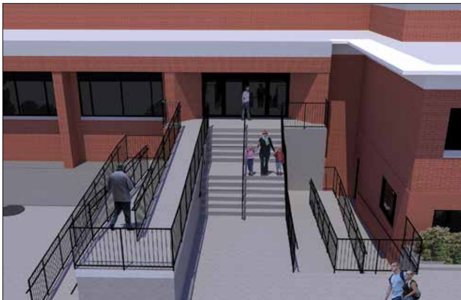
A rendering of the new ramp entrance at the JCC.