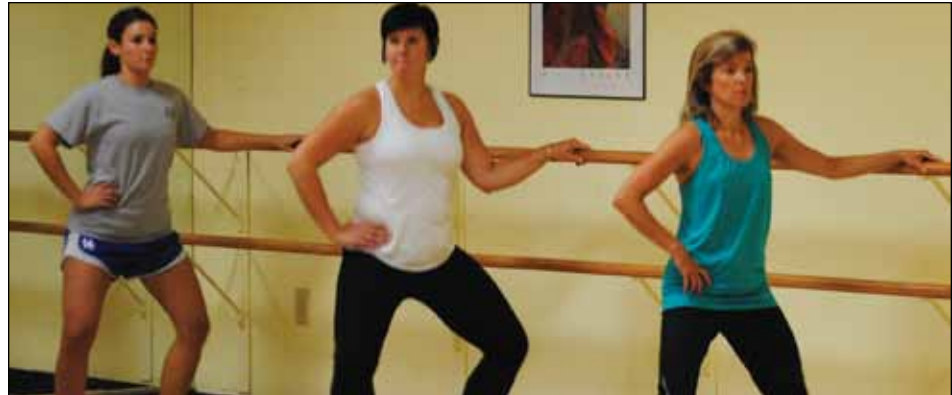
JCC members perform a plié during the Monday night J-Barre class.

But the music and pace are up beat, and participants move quickly into other