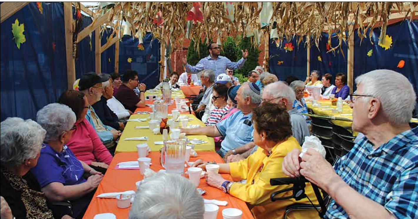
Seniors eat lunch at the JCC Sukkah. The sukkah sits in Family Park each year during Sukkot to teach people about the holiday. More pictures from celebrations at the JCC Sukkah can be found online at www.jewishlouisville.org

Tickets are only $7 for youth age 10 and under and $12 for adults. Visit www.CenterStageJCC.org/actingout to reserve tickets.