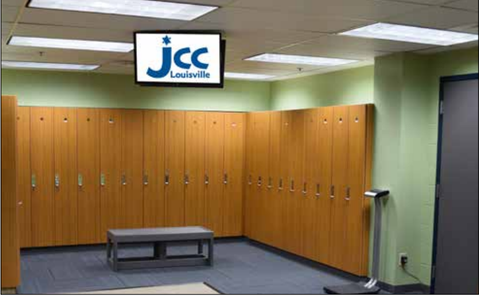
On December 5, the Men's and Women's locker rooms re-opened to much excitement. Old metal lockers were replaced with new wooden ones on both sides. New flooring and paint were in put in and the men's vanity was re-placed. The upgrade was paid for by the JCC Meet the Challenge Campaign, which is raising $120,000, all of which will be matched by the Jewish Heritage Fund for Excellence.